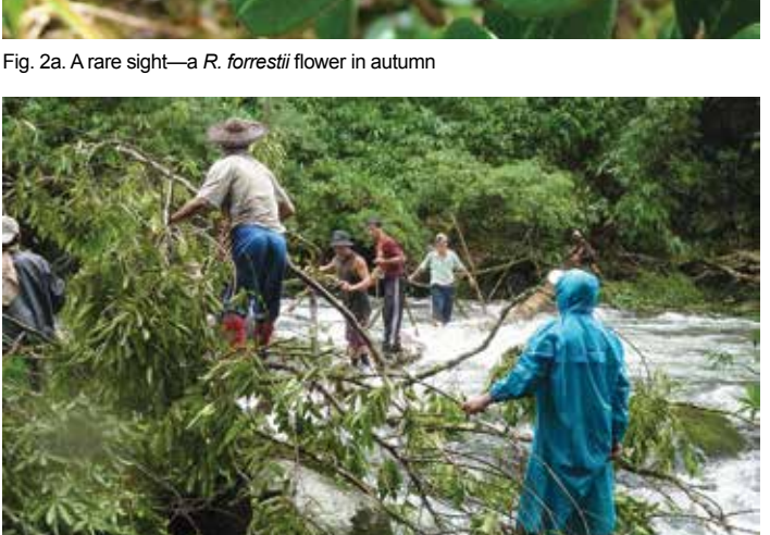
Fig. 3. River too deep to ford? Just fell a big tree with your machete!