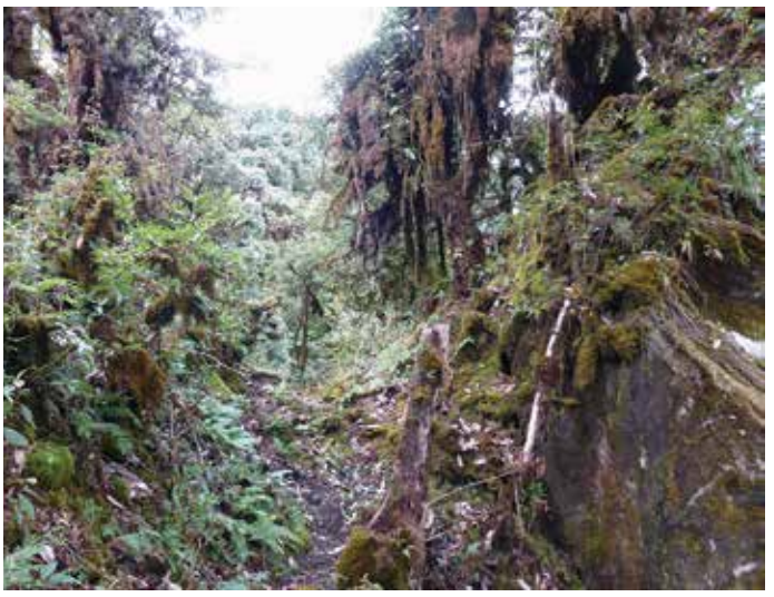
Fig. 7. Rhodo habitat on the ridge at 2800 m (9186 ft).