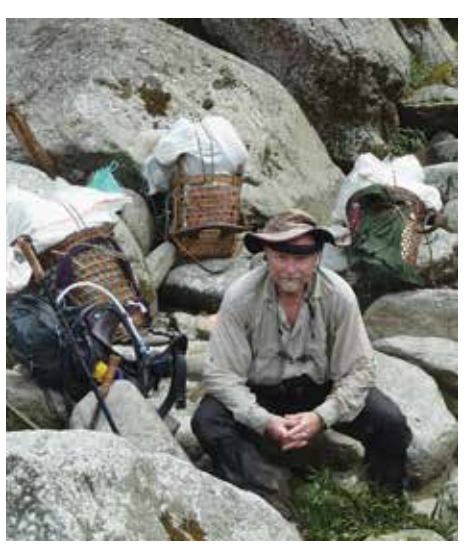
Fig. 11. The author on the MaDoi River shore.