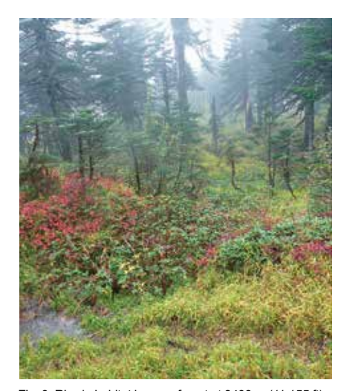
Fig. 9. Rhodo habitat in open forest at 3400 m (11,155 ft).