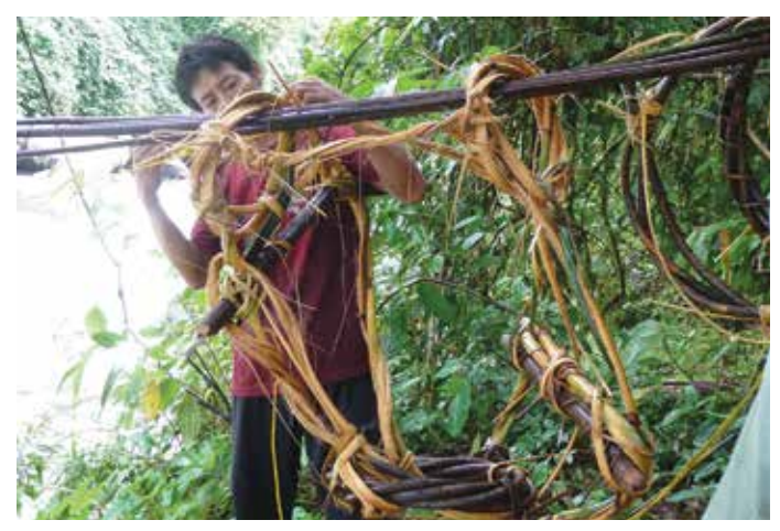
Fig. 4. Rawangs make everything with rattan.