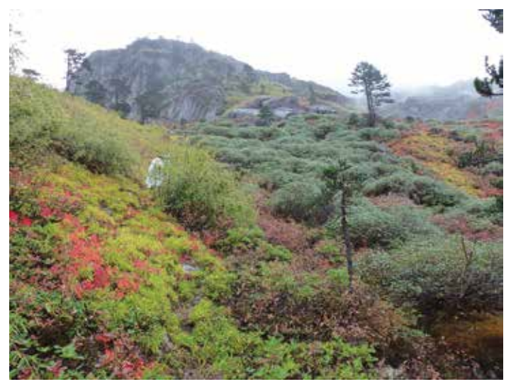
Fig. 8. Rhodo habitat at the treeline at 3600 m (12,467 ft).