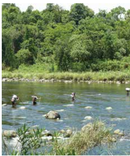
Fig. 10. Porters fording a river.