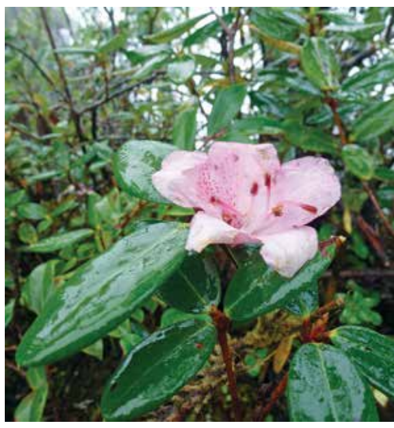
Fig. 6. R. martinianum.