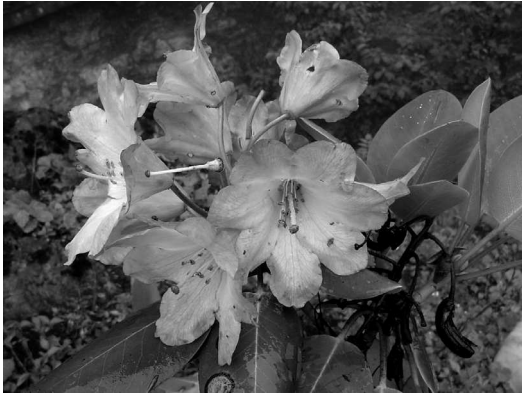
Fig. 2. Flowering specimen of Rhododendron qiaojiaense.